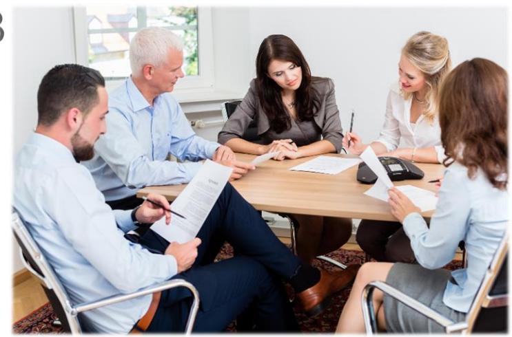
What are they having a meeting about?