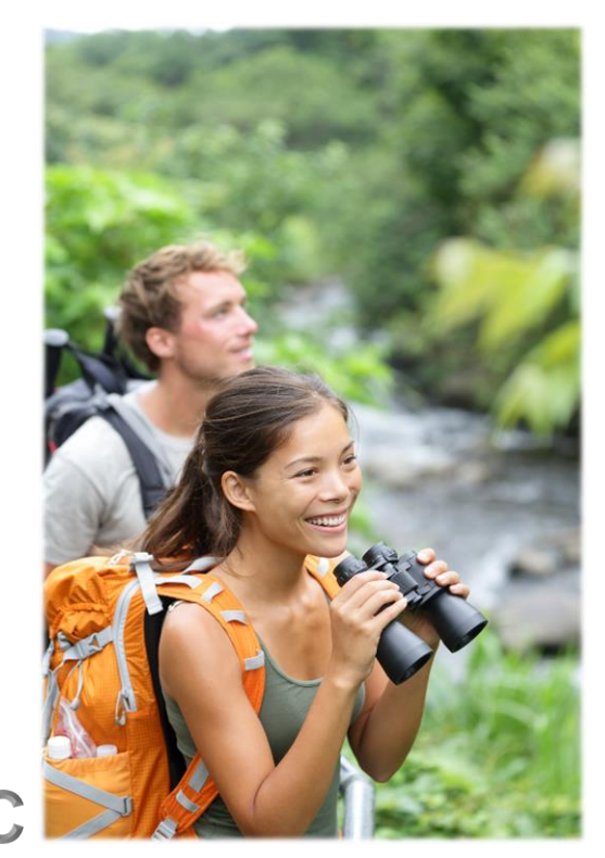
What are they looking at?