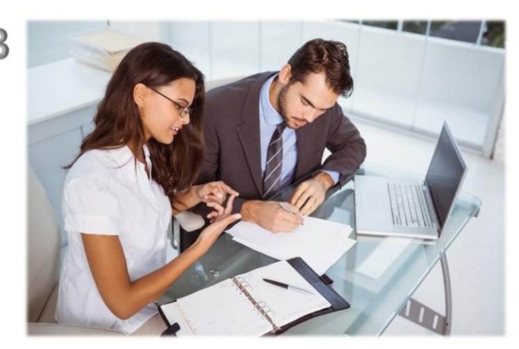
What project are they doing?

*Create a short story using the following format