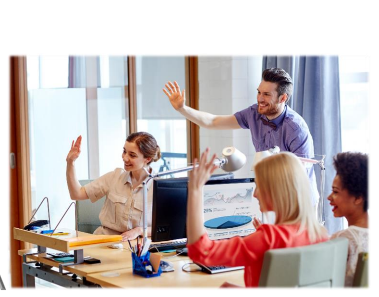
Who are they waving at?

What is that document the man is holding in his hand?