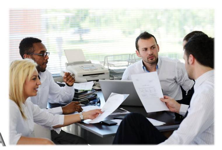
What are they discussing?