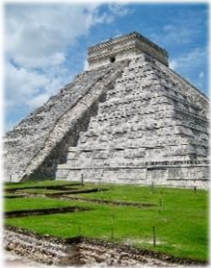
Chichén Itzá, Mexico