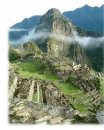
Machu Picchu, Peru