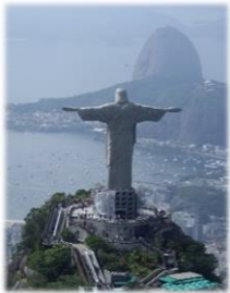
Christ the Redeemer Statue, Brazil