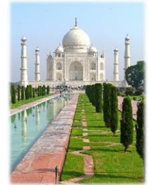
Taj Mahal, India

Which modern Wonder of the World would you like to visit?