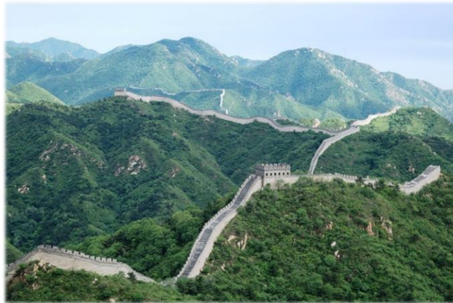
Great Wall of China

Which modern Wonder of the World would you like to visit?