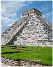
Chichén Itzá, Mexico