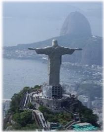
Christ the Redeemer Statue, Brazil